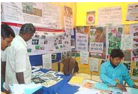
Participation in Krishimela in Bankura II Block (2)