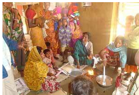
Demonstration on Nutrimix in Chhachanpur village, Ghosergram