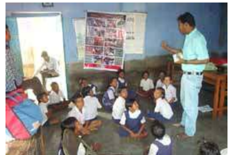
Workshop with students in Bhalaidiha