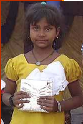
Children with prizes

February 1, 2014 Street to School project of DRCS organized its Annual Sports in Banga Bir Sangha Maidan near Pagladanga, Dhapa. Around 210 children were present in this sport. All the children from 6 different facilitation centres participated in the event. Children group members were also present there