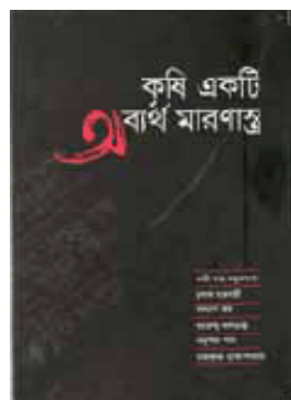
A collection of critiques of AKI