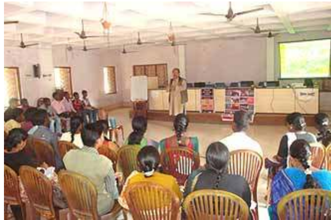
Youth Group orientation on RTI

Recent activities of Fight Hunger First Initiative Project