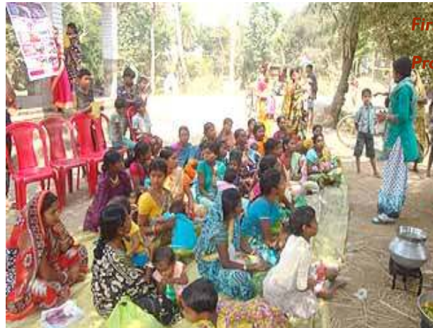
VHND in Kalipur village, Jhunjka GP