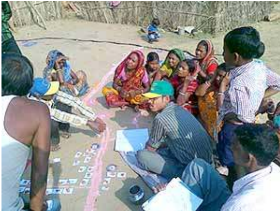
PRA in Dhadanga village for preparing Village based development micro-plan

Recent activities of Fight Hunger First Initiative Project