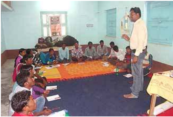
Youth Group orientation on Joyful learning

Objective: To improve key indicators related to food, income and nutrition security in Chatna Block, Bankura