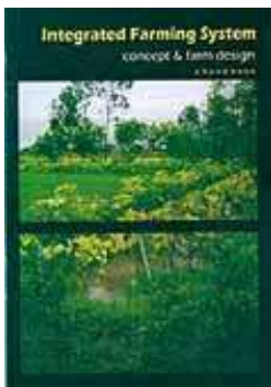
Integrated Farming System