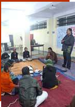
Post Vocational Camp going on

How to prepare Bio-Data. What types of quality they should acquire to develop their potentiality. What will they do after completing the courses. We tried to give some information regarding different schemes of Govt. to start a small business on the basis of the skills which acquired.