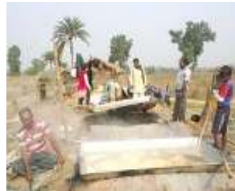
Making of palm jaggery

The dry land districts of West Bengal (Purulia, Bankura, Birbhum Paschim Midnapore) by default are