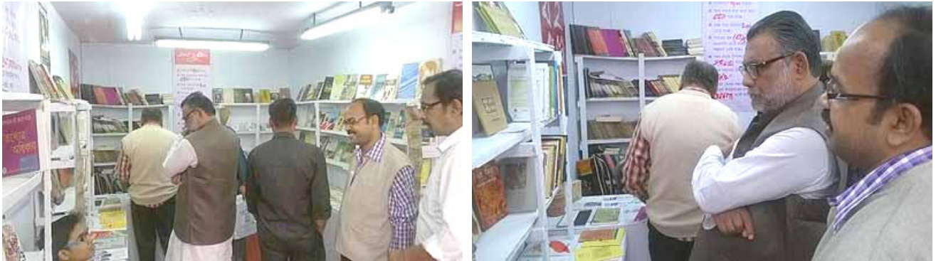
The Grace Presence... Hon'ble Minister , Dept. of Agriculture, West Bengal, Mr. Purnendu Basu at DRCSC stall