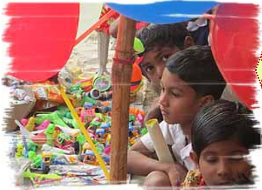
Children in a toy stall