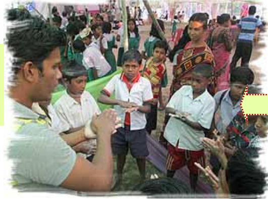
Demonstration on hand washing