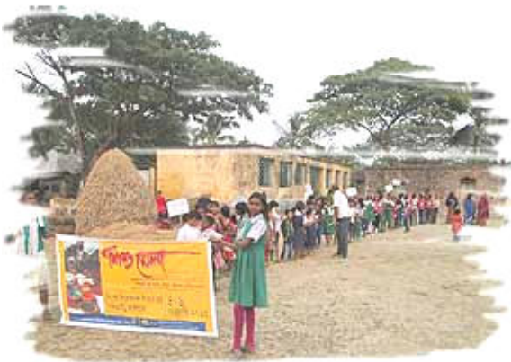
A rally to ban child labour...